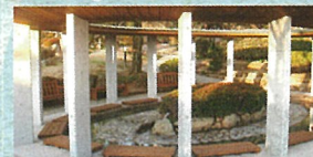
Oniishi Bozu Jigoku